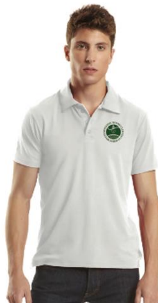
1. WHITE WITH FOREST GREEN