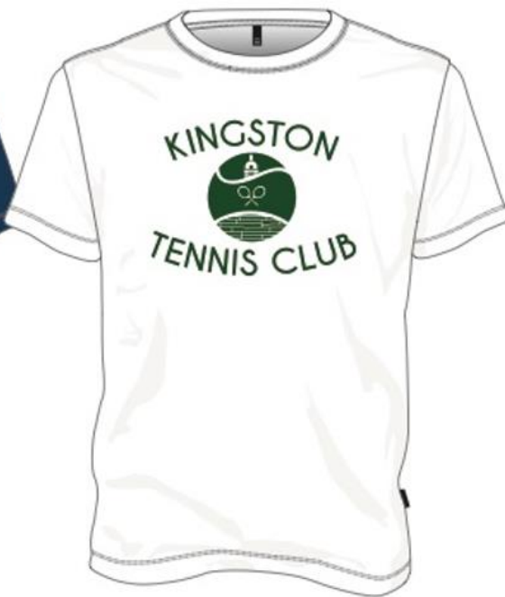
2. WHITE WITH FOREST GREEN