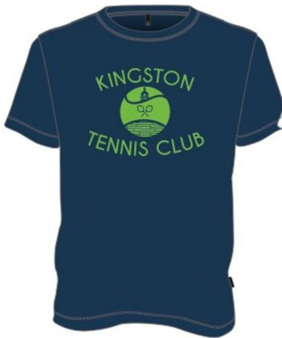
1. NAVY WITH ELECTRIC GREEN