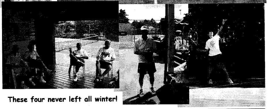
These four never left all winter!