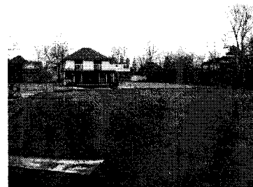
Courts 2 and 3 await a paint job

get the courts and the clubhouse into shape. We hope that you can spare some time that day to come down to the club to help out. Bring a rake – we will supply the coffee and doughnuts. Membership rates, I am glad to say, are the same as last year. As usual we have an early bird rate