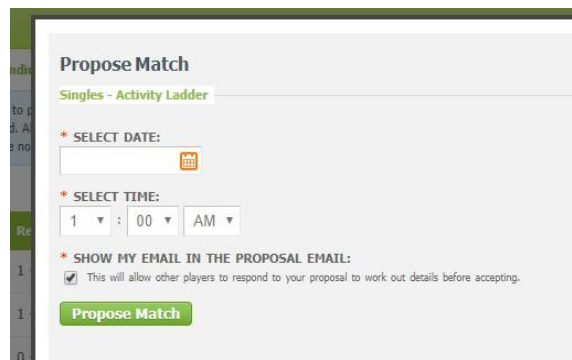
Figure 4: Interface for selecting date & time for an open proposed match to the rest of the ladder.