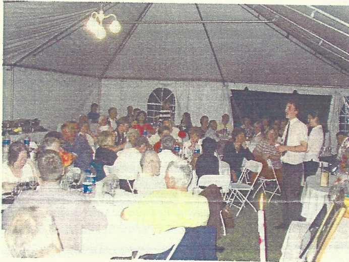
Bid early! Bid often!