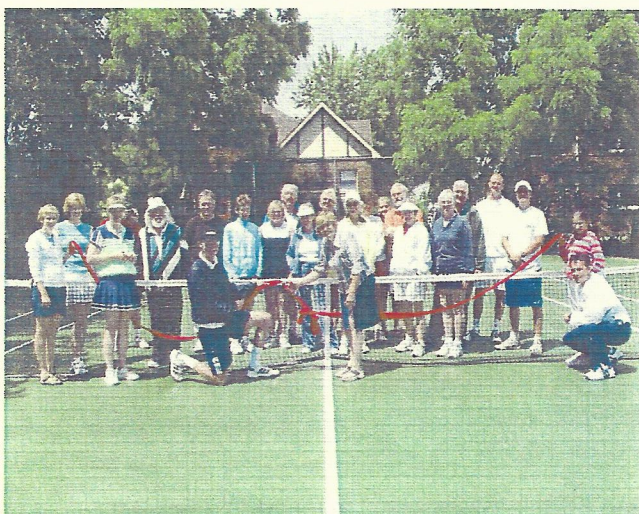
Reason to celebrate! The ribbon is finally cut on Court 7.