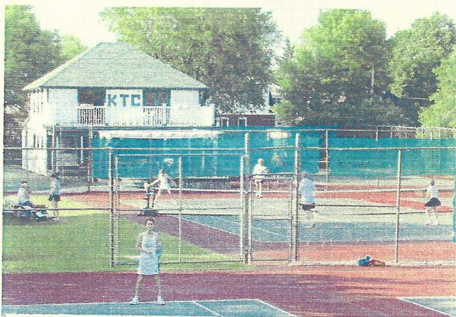
The Doubles League in Full Swing

The good news is that Courts 4,5 and 6 (the back courts) will be completely resurfaced as soon as weather permits -- by the third week of May, we hope. This is a major undertaking (budgeted at $48,000) and we have applied for an Ontario Trillium Foundation grant to assist us with it. We previously received a $15,000 Trillium grant for Court 7, and await the announcement (expected in early April) with optimism. Courts 4 and 5 in particular have heaved and deteriorated over the years, and three brand new, lighted courts will be a huge boon to members.