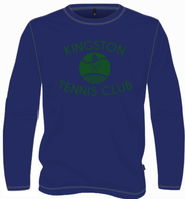
Royal Blue with Forest Green