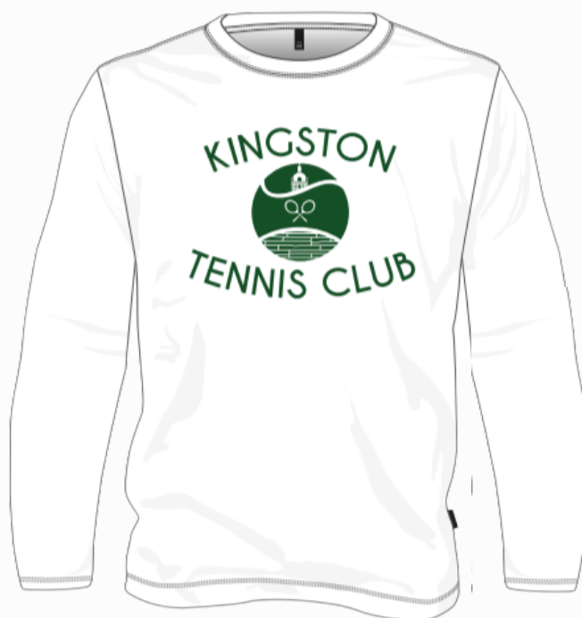
White with Forest Green